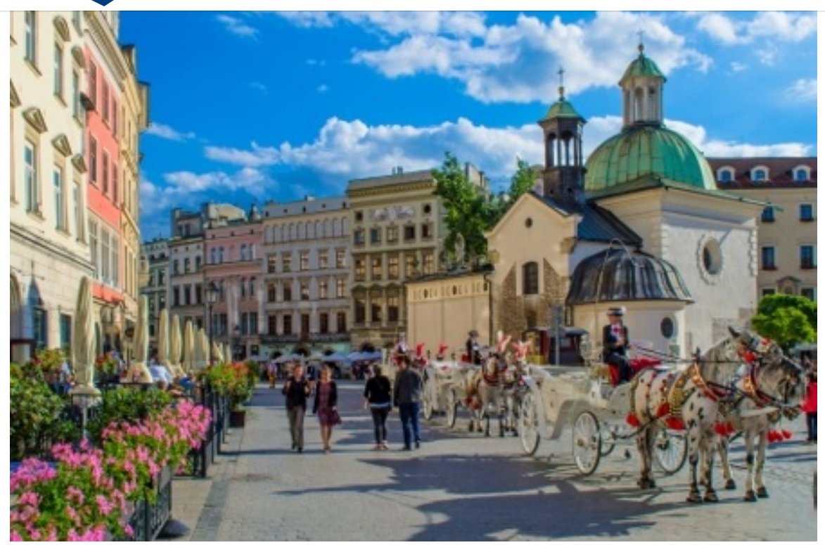
Day 1 April 19, 2022 Tuesday

We meet you at the airport in Krakow and provide transportation to your hotel in the center of Krakow.