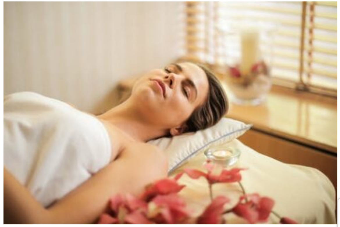
Day 4 April 22, 2022 Friday