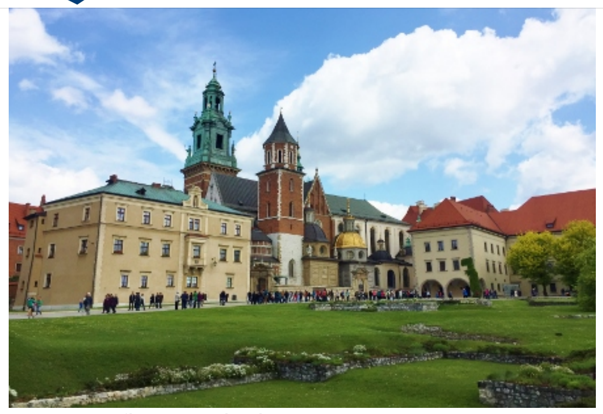
Day 2 April 20, 2022 Wednesday

After breakfast we continue sightseeing Krakow and start the day in the Jewish district called Kazimierz which owes its really unique character to over five hundred years of Jewish traditions. We also have a lunch there. In the afternoon we go back to the Old Town to see the Wawel Castle – the most important residence of Polish kings, and the Wawel's Cathedral which used to be a coronation place of all the Polish kings. The day ends after Dinner .