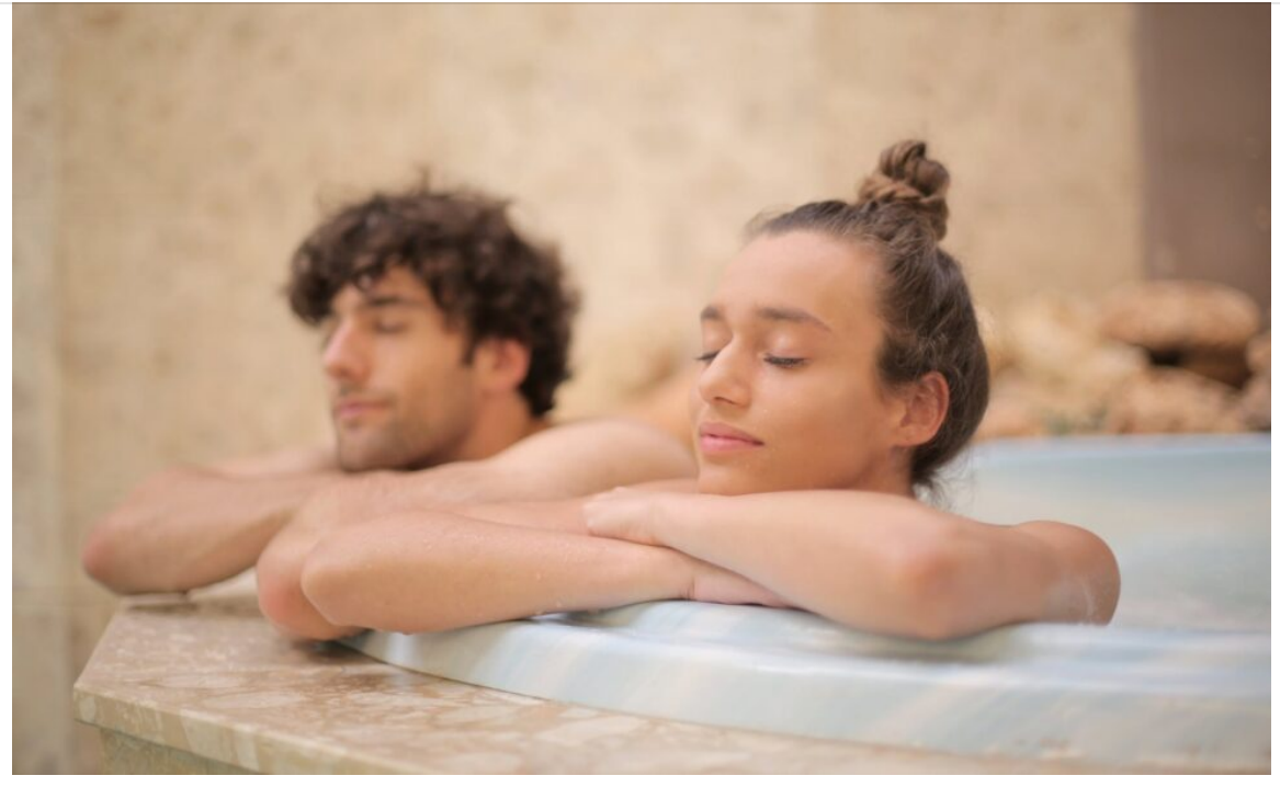
Day 7-10 April 25-28, 2022 Mon-Thur

We spend 4 whole days in the 4-star Hotel considered as the leader on the Polish Medical and Resort market , a place cultivating the original idea of SPA – Sanus Per Aquam meaning "healthy through water". Its unique offer includes sulfur baths in the world's strongest sulphide water from the Malina spring.