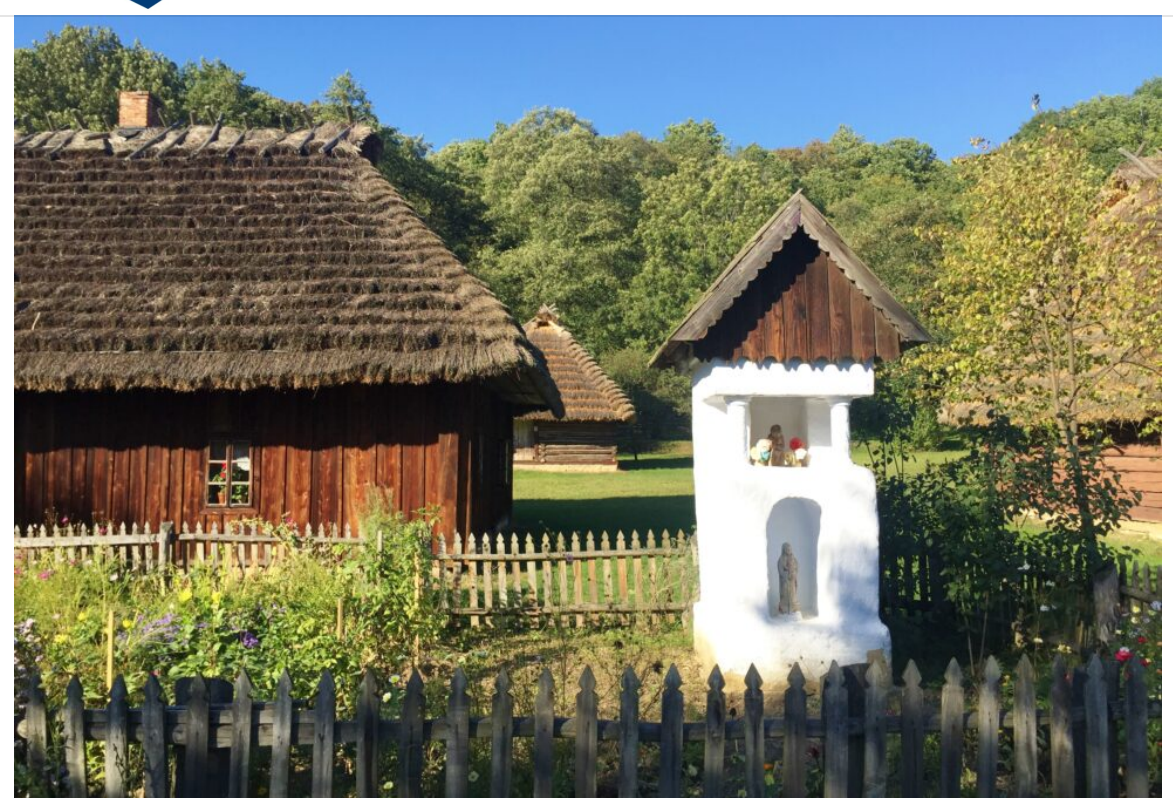
Day 6 April 24, 2022 Sunday

In the morning we drive to Stary Sącz and Nowy Sącz – one of the oldest Polish towns. In the suburbs of the city, we visit an open-air museum where the traditional Polish architecture is preserved. We have an extraordinary chance to see both poor village cottages and the country estates. Most of the houses are over 2 or 3 hundred years old! After lunch served in the traditional Polish inn, we drive to Busko-Zdrój – a mineral spa to relax properly and check out their medical treatments.