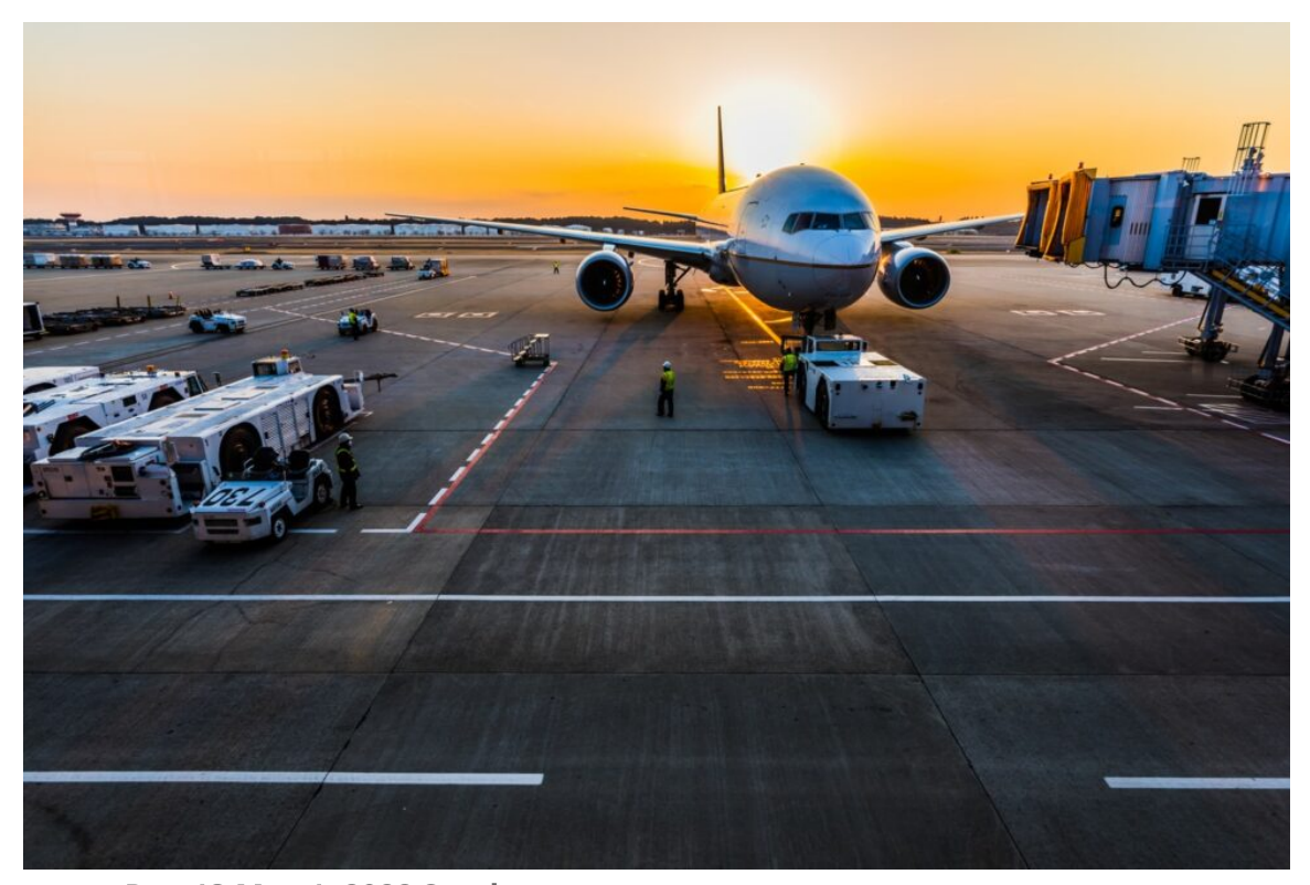
Day 13 May 1, 2022 Sunday

Final day in Warsaw. The last glance at the capital city of Poland, free time, shopping and relaxing before departure.