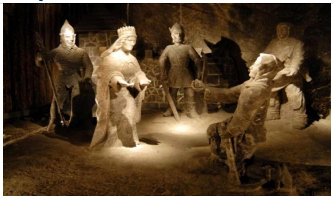
Day 3 April 21, 2022 Thursda

In the morning we drive to Wieliczka – famous for the salt mine that is a unique place in the history of mining as rock salt deposits were mined continuously from the 13th to the end of the 20th century. The scale of excavation is very large, with corridors, galleries, and chambers , as well as underground lakes , in total more than 120 miles in length. We go back to Krakow and you can enjoy the rest of the day by yourself, before leaving Krakow on the next day.